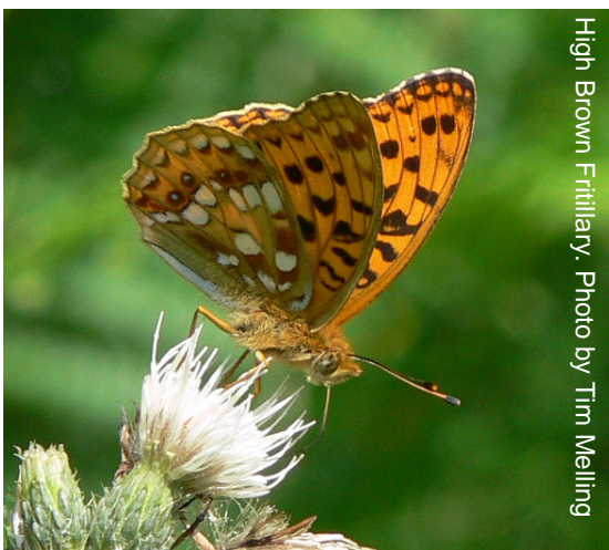
High Brown Fritillary.