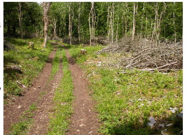
Halecat Woods after ride widening. Since the images were taken, GrantScape funding has been used to increase the amount of breeding habitat by chipping and disposing of all the brush piles.