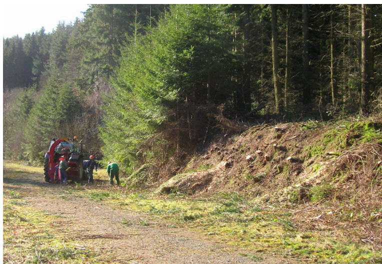
Management work in progress at Bury Ditches.

As a result of the success of the mowing and opening up work (in terms of increasing both Wood White numbers and the plant diversity) in 2009 we came up with a much larger scale 'Stepping Stones' project. This was a landscape-scale idea of linking up 12 woodlands (including Blakeridge Wood, Bucknell Wood, Hopton Wood, Purslow Wood and Radnor and Bury Ditches, Grade A priority woodlands in the Lepidoptera on Forestry Commission Land in England; Conservation Strategy 2007-2017 ), all with good historic butterfly records and using the Clun valley woodlands as the epicentre. The topogra-