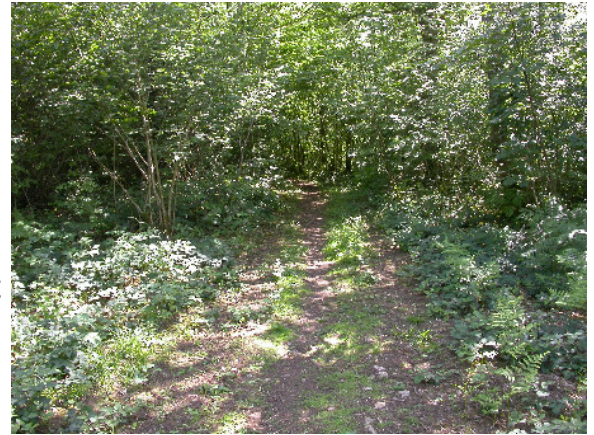
Halecat Woods: a privately owned site. Image taken before ride widening was carried out as part of a woodland improvement grant.

Volunteers play a key role in surveying and monitoring Lepidoptera on Forestry Commission England sites. The data this provides is vital to enable understanding of the changes in Lepidoptera populations and provides a basis for management advice. To encourage further survey work at Forestry Commission England sites, get in touch with the local Butterfly Conservation branch ( www.butterfly-conservation.org/bcbranches ) and other local volunteers. If Forestry Commission staff request survey work, there may be Forestry Commission funds available to fund volunteer expenses. Members of Butterfly