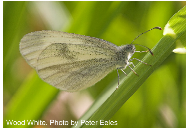
Wood White.

Here in Shropshire/North Herefordshire the Wood White is doing well, hopefully with the work we are doing and the plans afoot it also has a rosy future? As I have said when giving presentations etc, my hope is that when I come to retirement age I am still having to explain that the slow, floppy, white butterfly is not a cabbage white.