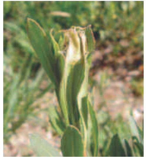
above Larval spinning on Bog Myrtle below left Ideal habitat with birch regrowth below top Ideal Bog Myrtle habitat below bottom Larval spinning on birch

The best method is to search for adults on warm sunny days. Larval searches (in June and July in southern England, and from late July to early September in the north) can be worthwhile to identify foodplants and key breeding areas. Care should be taken when searching for the larva as it can be confused with other species which feed on birch and Bog Myrtle in a similar way.