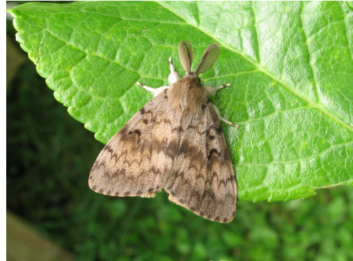
Gypsy Moth male

which has a dark brown tip. The male has feathery antennae.