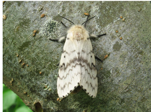
Gypsy Moth female