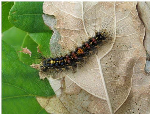
Gypsy Moth caterpillar

Identification: The caterpillar and the male, which can fly by day, are the most usually encountered stages. The caterpillar is dark grey with light brown hairs, heavily marked black on the upperside, with 5 pairs of blue warts on the segments nearest the head end and reddish warts on the segments from about 1/3 rd of the body length.