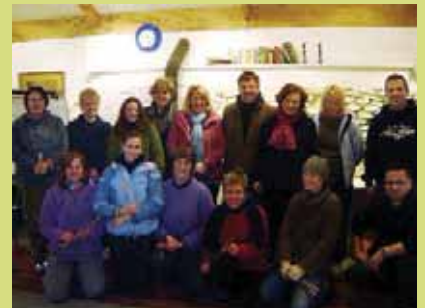
The Forest School trainees

The group will also run some Forest School sessions in their own schools to familiarise themselves with what's involved. In advance of this, we are currently running some 'taster' sessions in all the participating schools.