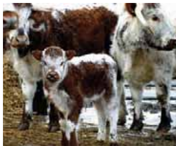
The newest member of the Neroche herd!