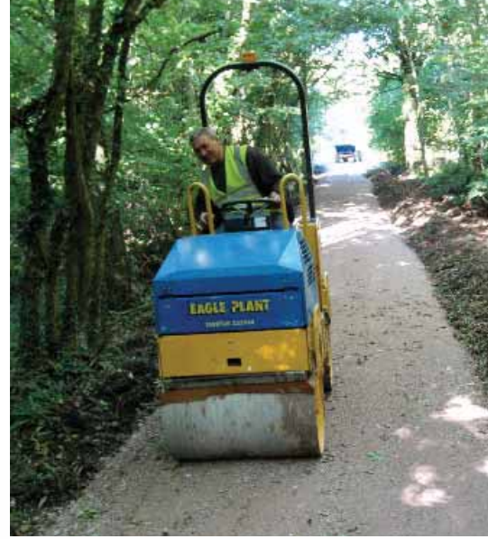
Work in progress on the new Herepath

There are two public car parks on the route, at Castle Neroche and on Staple Hill, and horse box parking can be arranged at local farms, pubs and livery yards on the route.