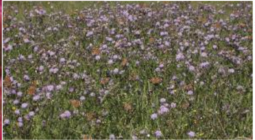
Above: Field of Painted Ladies. Left: A Painted Lady swarm on Jersey at the end of May.