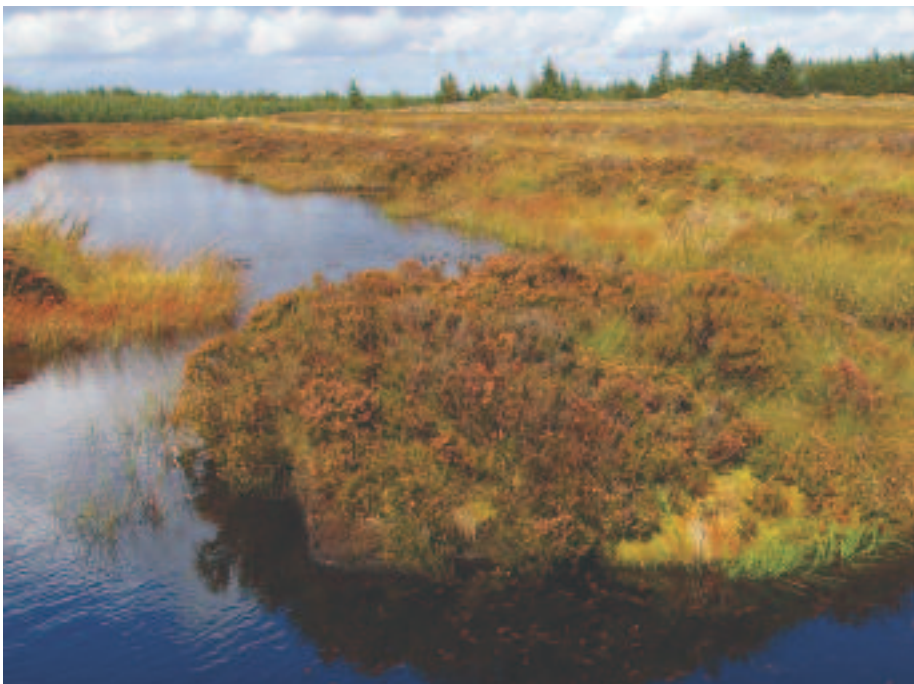
below Suitable habitat in blanket bog, with Hare's-tail Cottongrass and Cross-leaved Heath