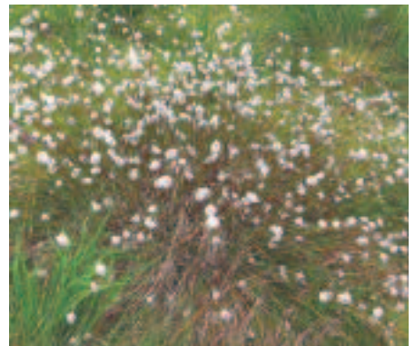
below Foodplant - Hare's-tail Cottongrass