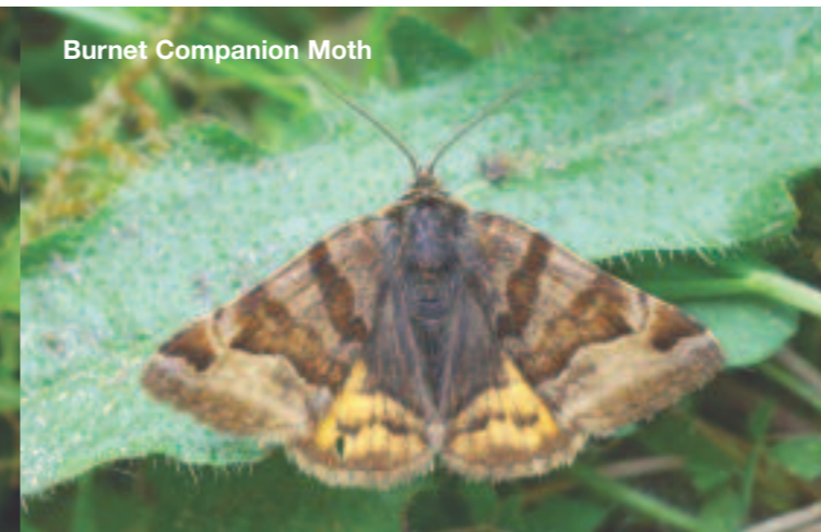
Burnet Companion Moth