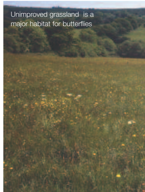
Unimproved grassland is a major habitat for butterflies

3 Strips and patches of grassland along hedges, ditches and tracks, in field corners, within orchards and other uncultivated areas. Such grassland is the main breeding area for most widespread butterflies on farmland and can be encouraged in a variety of situations: