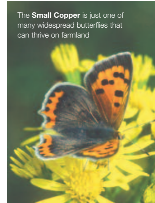
The Small Copper is just one of many widespread butterflies that can thrive on farmland