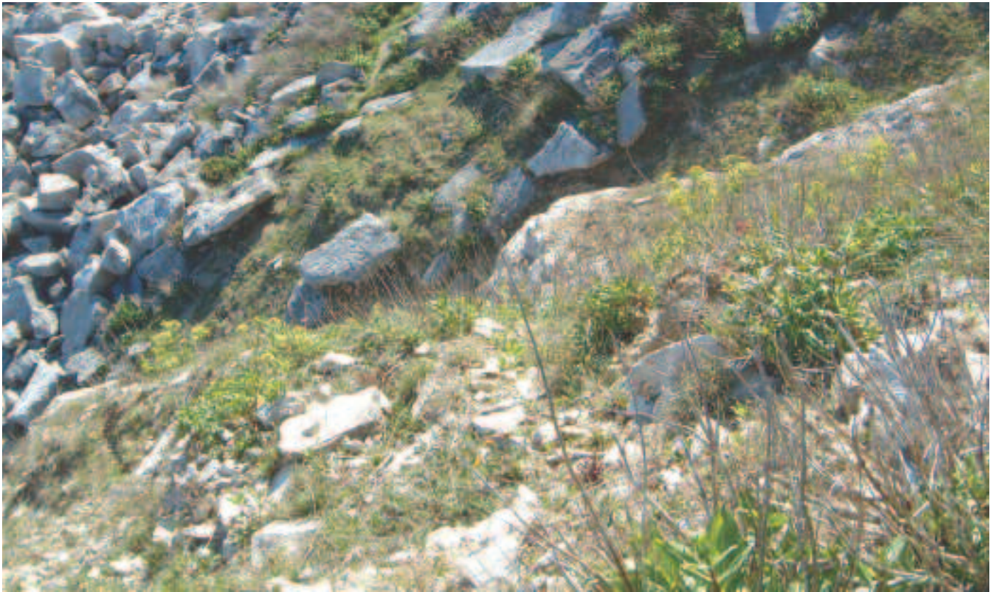
below Suitable habitat in an old quarry site