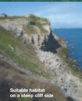
Suitable habitat on a steep cliff side