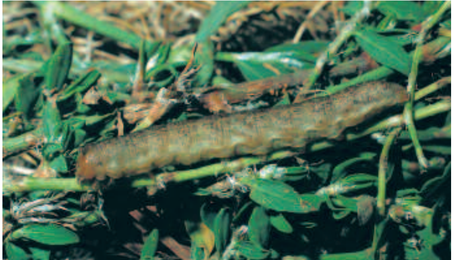
above Bordered Gothic larva

Please contact Butterfly Conservation if the species is suspected to be present on a site.