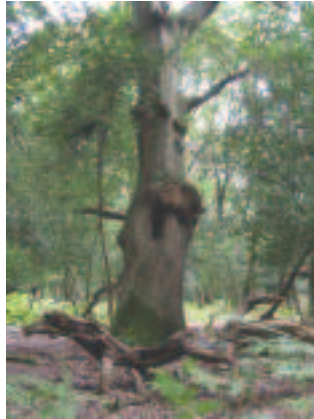
left Suitable large mature oak