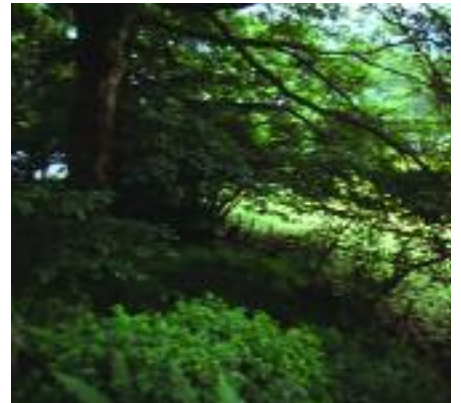
above Ideal woodland habitat top left Touch-me-not Balsam, the larval foodplant left Gardens can contain ideal habitat below left Small Phoenix larva below Netted Carpet larva