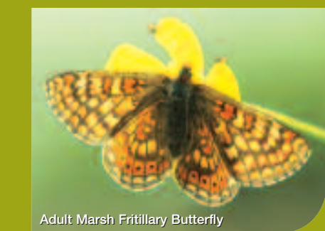
Adult Marsh Fritillary Butterfly