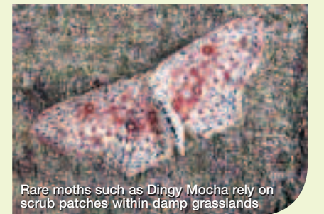
Rare moths such as Dingy Mocha rely on scrub patches within damp grasslands.

Scrub habitats are extremely important and should never be eradicated. On average 5-10% scrub cover is desirable. Species such as the endangered Dingy Mocha moth rely on isolated patches of scrub. Management is essential however as scrub can encroach into the grasslands very quickly.