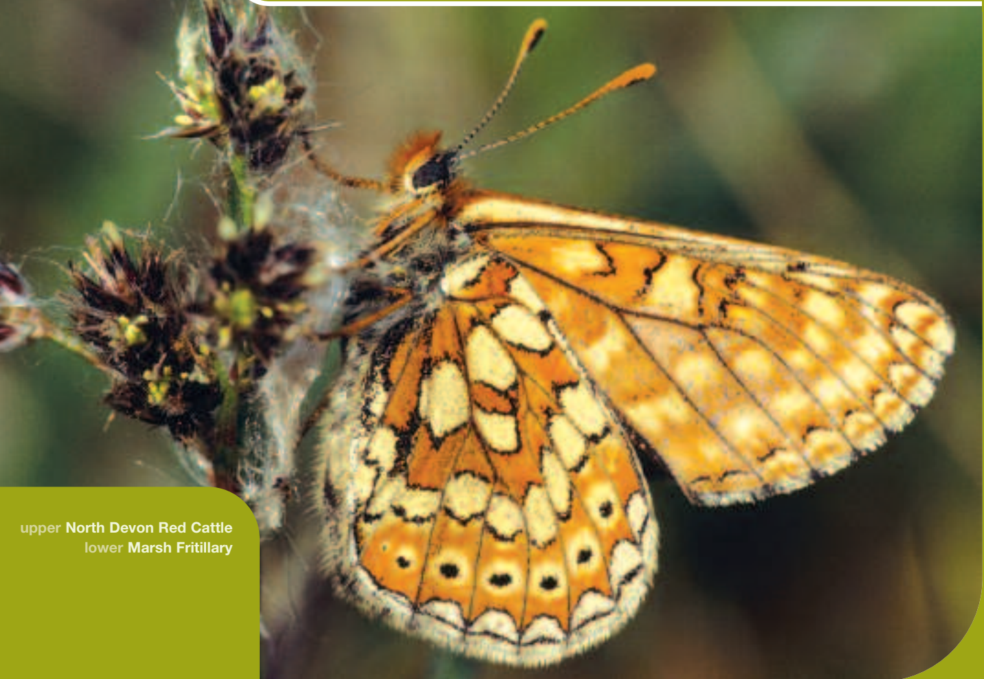
upper North Devon Red Cattle lower Marsh Fritillary

A practical guide to managing Culm landscapes