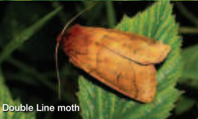
Double Line moth