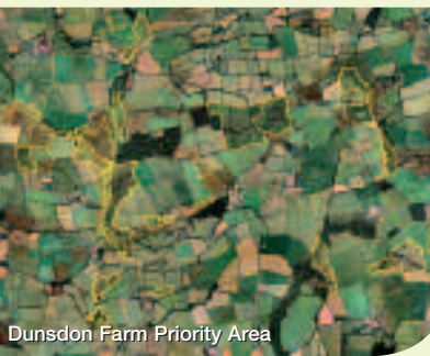
Dunsdon Farm Priority Area

Clusters of Culm grasslands still remain - the Re-connecting the Culm project will concentrate on these areas first to secure viable habitat networks and species populations.