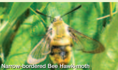
Narrow-bordered Bee Hawk-moth

Despite recent losses, Culm grassland remains one of the last UK strongholds of the Marsh Fritillary butterfly. This butterfly is a UK BAP Priority Species and listed on the EU Habitats and Species Directive owing to its severe decline across the whole of Europe. The habitat also supports populations of other UK Priority BAP Species such as the Double Line moth, Narrow-bordered Bee Hawk-moth, Dormouse, Otter and a wealth of other wildlife.