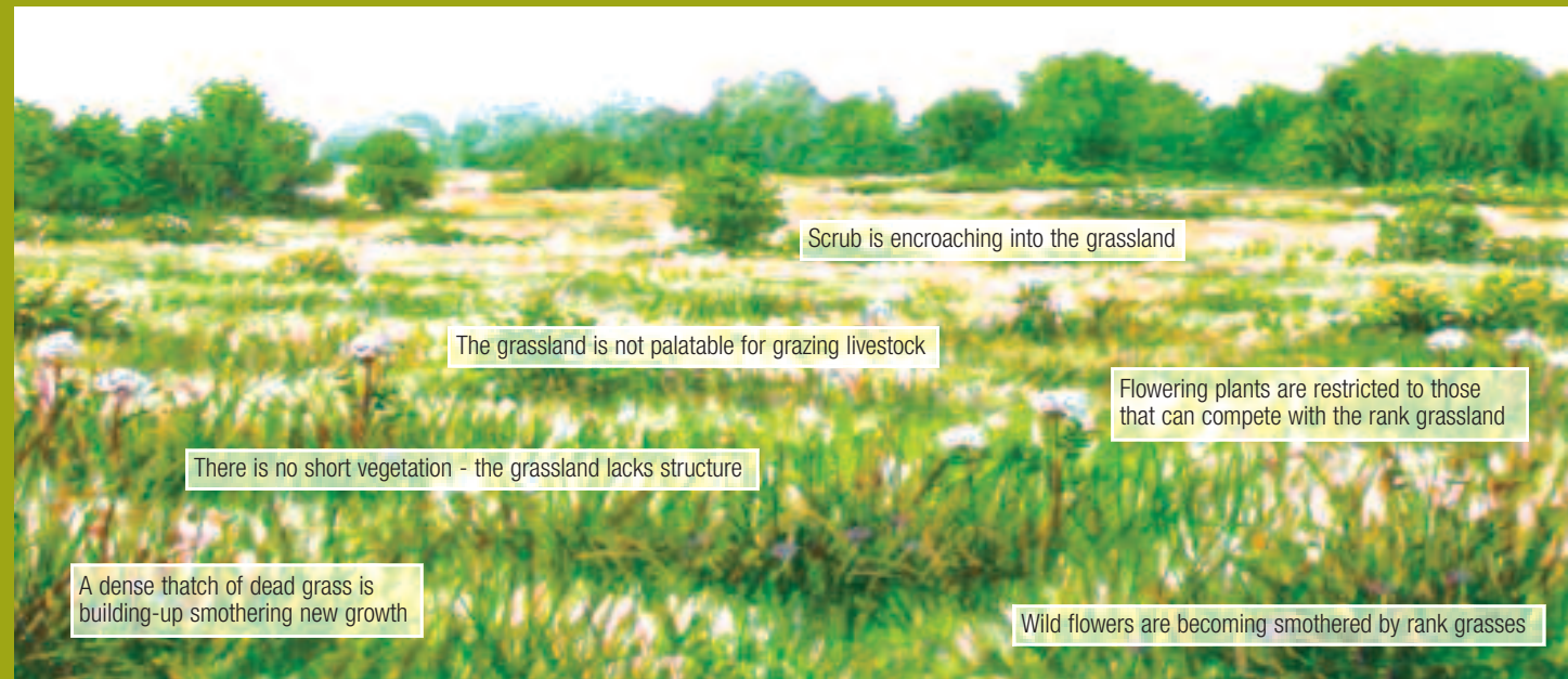
Scrub is encroaching into the grassland