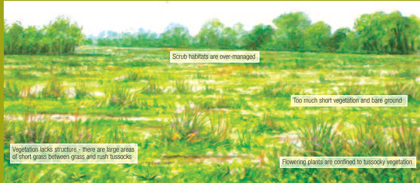
Scrub habitats are over-managed