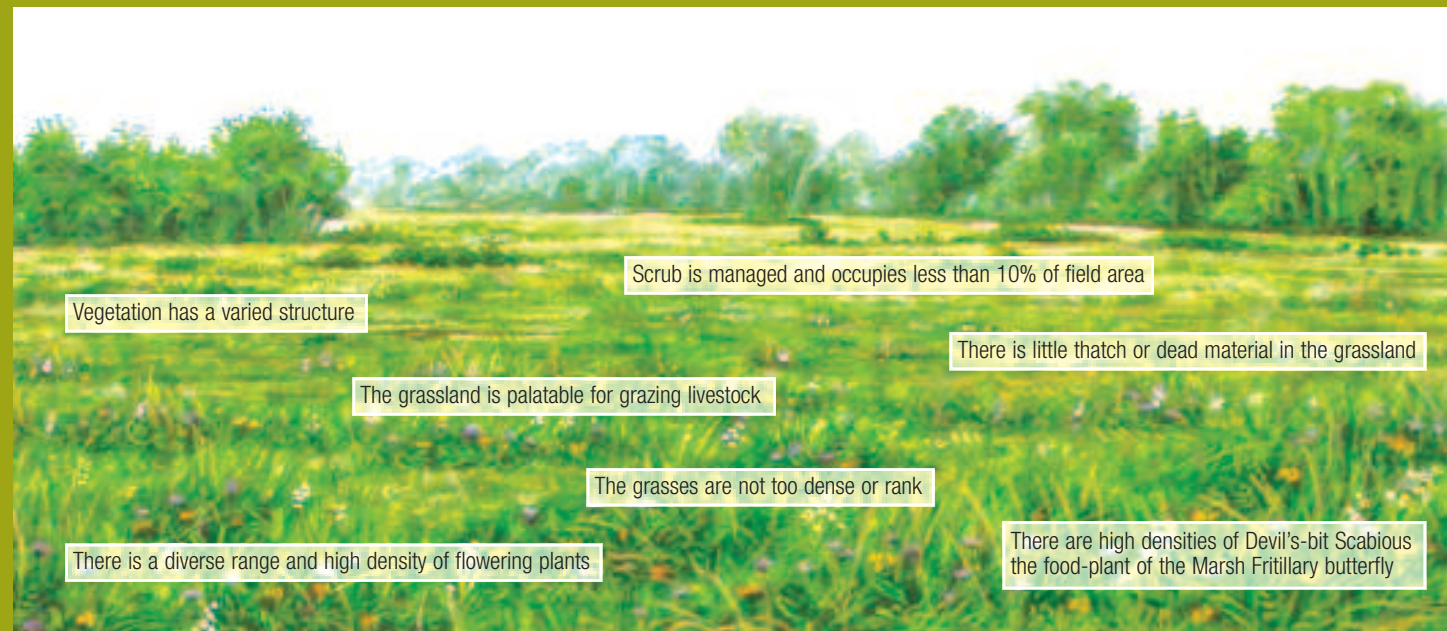
Vegetation has a varied structure