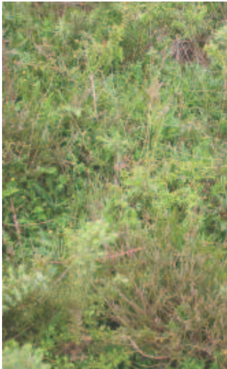
top right Reddish Buff larva above Desired vegetation structure with Saw-wort right Open heathland provides suitable habitat