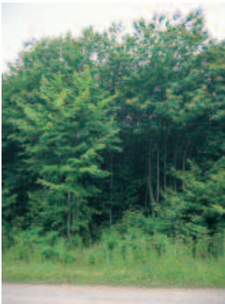
above Rideside habitat right top Coppice management is often vital to maintain suitable habitat right bottom Medium-aged coppice is thought to be ideal