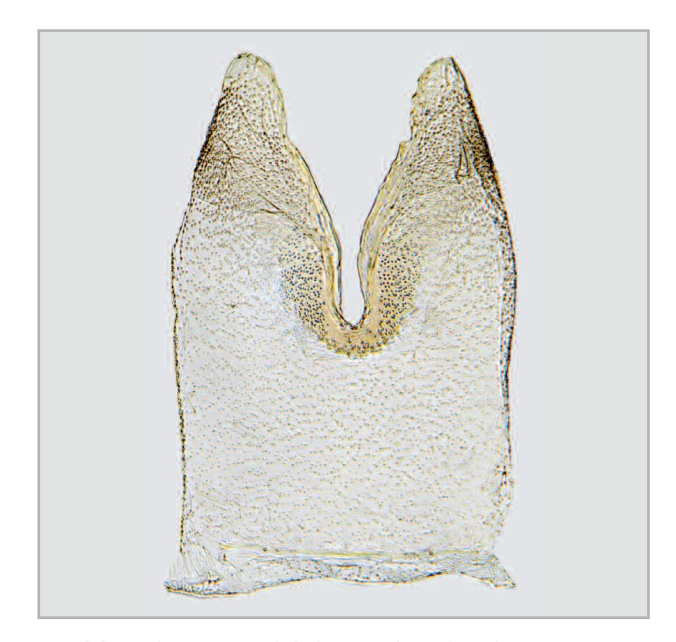
36. Macaria notata eighth sternite of male

Dusky Peacock Macaria signaria (Hübner) is superficially similar, but has only a slight concavity in the forewing termen and only slightly pointed hindwing, and is usually heavily dark-speckled. The dark mark on the post-median line of the forewing, although usually rather square or ill-defined, can be somewhat like a paw-print as in notata and alternata . Therefore, it could possibly be overlooked in the field as a worn example of one of those species.