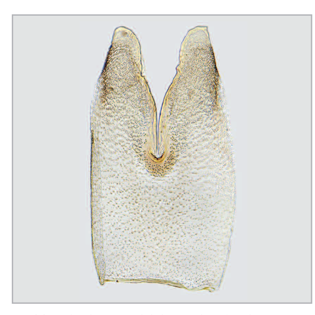
37. Macaria alternata eighth sternite of male