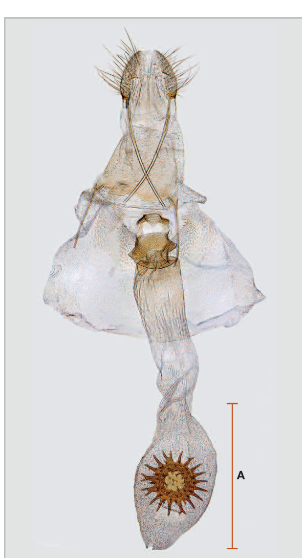
38. Macaria notata female